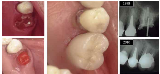
Fig. 2. Palatal root resection teeth 26, 12 years' follow-up.