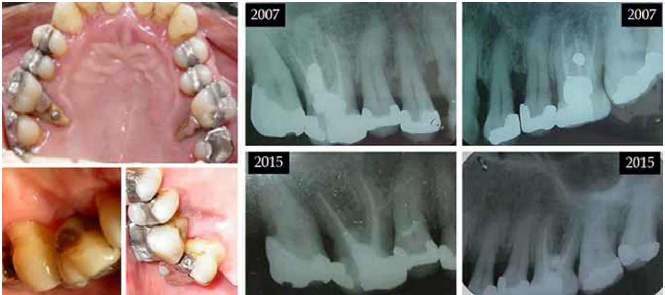
Fig. 3. Palatal root resection tooth 16 and 26, 8 years' follow-up.