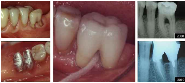
Fig. 1. Hemisection teeth 36, total crown, 19 years' follow-up.