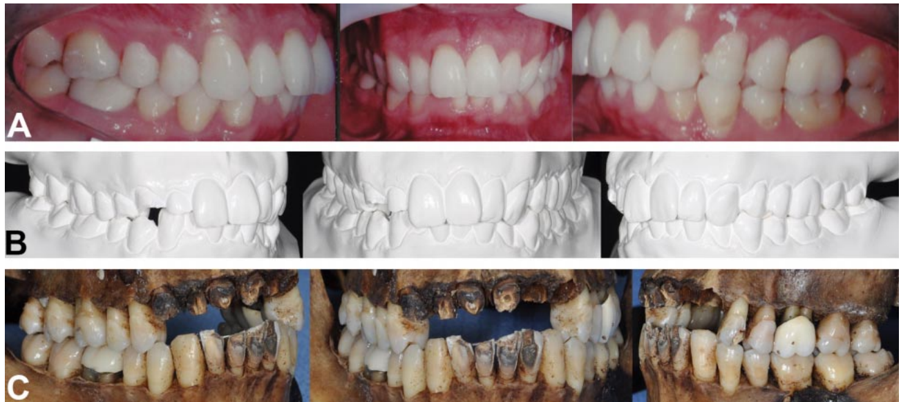
Fig. 1. Photographs ante-mortem (A – clinical; B – plast model) and post-mortem (C).