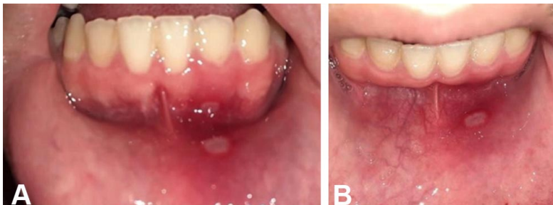
Fig. 1. (A) Two shallow ulcerative lesions located in the gum region and in the internal mucosa of the lower lip. (B) Ulcerative lesions located in the internal mucosa of the lower lip and ulcerative lesion located in the inner surface of the lower lip and petechiae in the anterior region of the lower lip mucosa.

The patient reported that on the 3rd day after the onset of symptoms he used oral azithromycin (500 mg) once a day for seven days, oral dexchlorpheniramine (2 mg) once a day for ten days, oral ivermectin (200 mcg/kg) in a single dose, and budesonide nasal spray once a day for five days. On the 9th day after the first symptoms, the patient reported a gradual return of taste and, without the use of any topical medication, presented a decrease in the number of petechiae as well as involution of ulcerative lesions (Fig. 2A). On the 11th and 15th day after the appearance of the first symptoms, it was possible to verify a smaller amount of petechiae and the complete healing, respectively, in the mucosa of the lower gum and the lower lip (Figs. 2B and C).