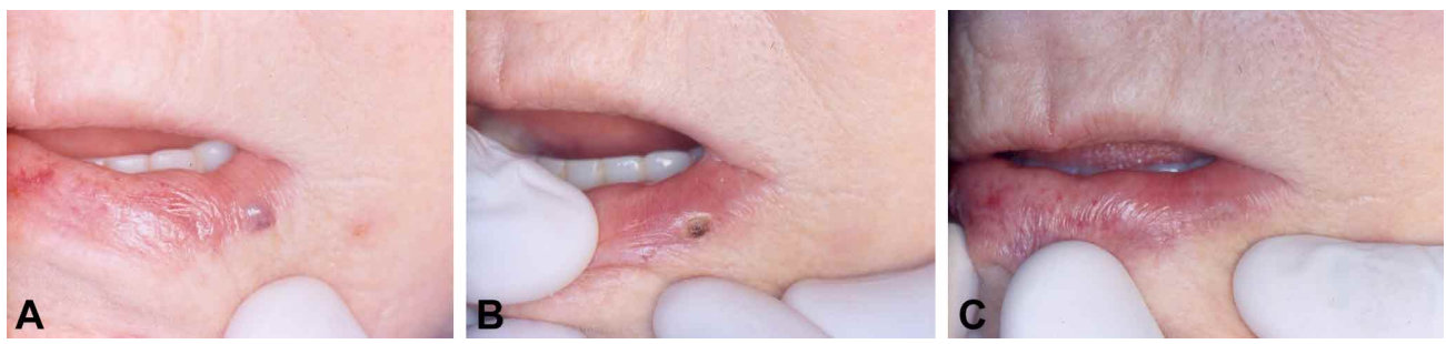
Fig. 1. A: Lesion appearance prior to the first ethanolamine oleate application. B: Lesion aspect after the first injection. C: the complete resolution after the sclerotherapy.