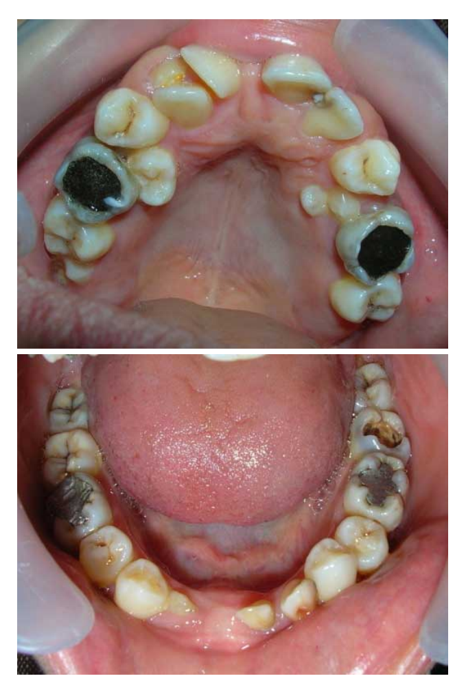
Figs. 6a, b. Intra oral view: The palate was highly with maxillary and mandibular arch perimeter deficiencies. Absence of 13, 23, 33, 32, 42, and 43. Persistence of 73, 72.

42, and 43. Persistence of 73, 72. Bilateral squeletal Cross-bite the first malar to the first malar (Figs. 7a, b and c). An orthopantomograph study showed inclusion 13, 23, 33 32, 42, 43, agenesie of 31, 41 of teeth (Fig. 8).