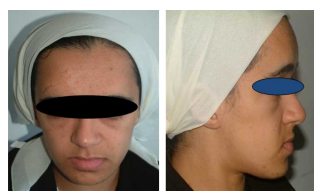
Figs. 4 and 5. Mild frontal hossing, retrusion of the middle face disharmony between the jaws due to and mandibular prognathism, with long face.

The oral soft tissues appeared normal; the uvula was complete, and there was no macroglossia. The palate was highly with maxillary perimeters narrow large mandibulary perimeters (Figs. 6 a and b).