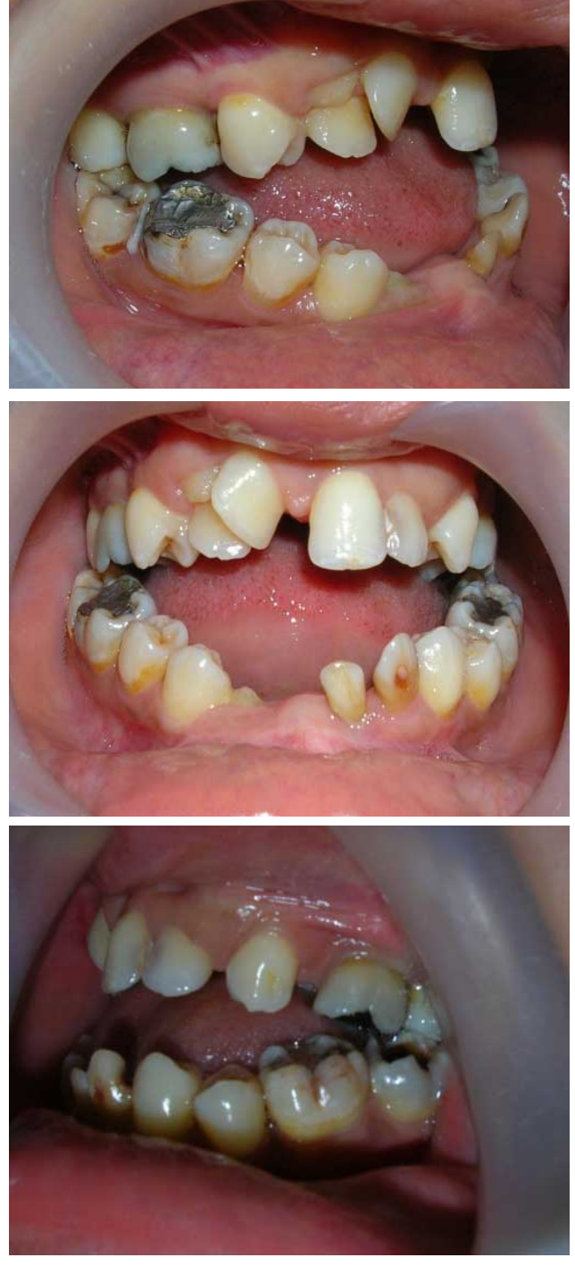
Figs. 7a, b, c. Intra oral view : maxillary and mandibular discrepancy. Bilateral squeletal Cross-bite the first molar to the first molar.

This disorder was first reported in medical literature in 1765. Marie and Sainton described the condition in 1898 and gave it the name cleidocranial dysostosis (Magnus & Sands, 1974).