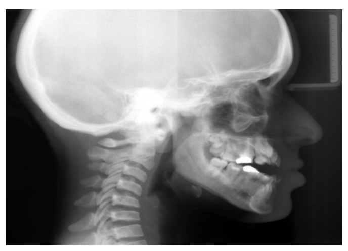
Fig. 9. Lateral cephalometric radiograph demonstrating, transitional Class III malocclusion with mild frontal hossing, and mandibular prognathism.

will include a failure of resorption of the roots of the deciduous dentition, as this note also calcification of a new supernumerary adjacent as also brought about by large multinucleated giant cells lying in Howships lacunae on the roots of the deciduous dentition.