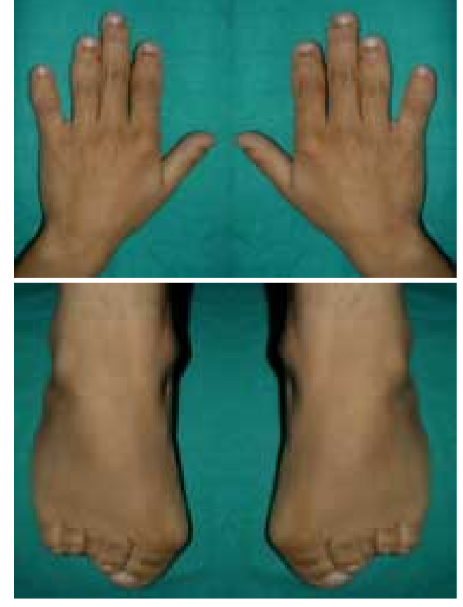
Figs. 2 and 3. Abnormalities of the bones of the hands and feet, especially pointing of the terminal phalangeal tufts.