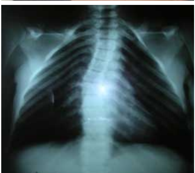
Fig. 1. Complete aplasia of the clavicles and associated funnelling of the rib cage towards the thoracic inlet. And a scoliosis associated.