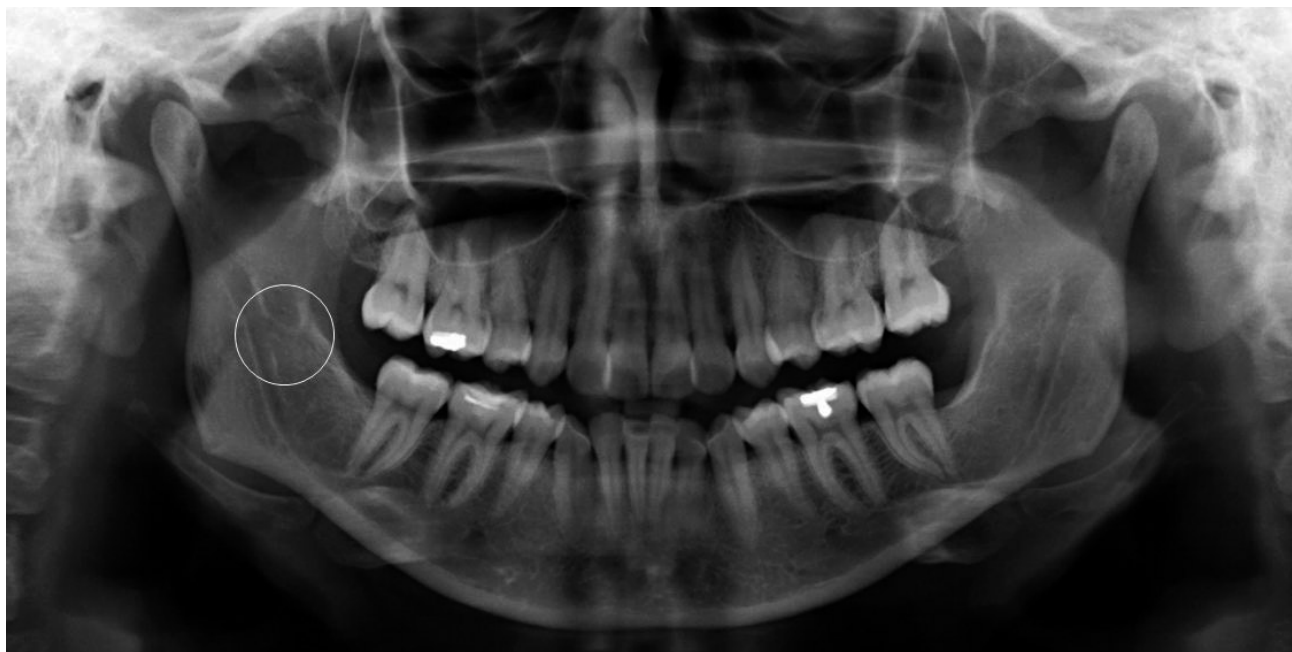
Fig. 1. The circle in the left shows a unilateral bifid mandibular canal that extends to the right third molar area.