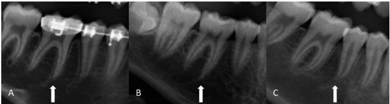
Fig. 4. The figures A and B show the Emergent conduits from the mandibular canal to the apex of the first molar (46 tooth), the figure C shows the conduct that goes to the apex of the 45 tooth.

On the other hand, during the observations it was noted that in 28 cases (4% n= 700), there were small conduits (Fig. 4) that emerge from the mandibular canal directly toward the apexes of molars, and in some cases premolars. The average age of these cases was 18.6 years (with a median age of 17 years, standard diversion of 5.33 years). This could correspond to a direct innervations and vascularization that requires in-depth study of the clinical as well as anatomopathological form, for the possibility of nerve damage or risk of hemorrhage in cases of dental extractions. The study realized by Sato et al. reinforces