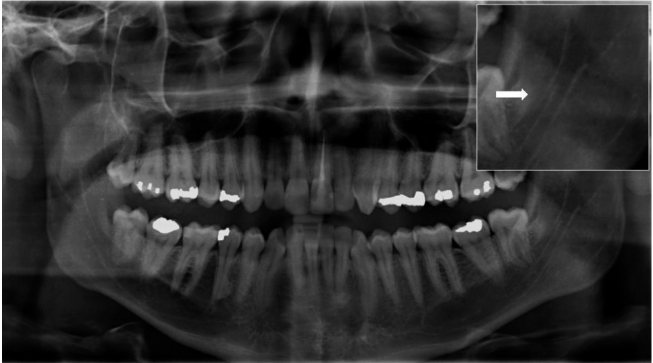
Fig. 3. The zoom in the upper right marked with the arrow corresponds to an image of the loss of continuity of the upper cortex on the mandibular canal.